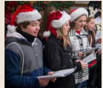
Holiday Open House December 13, 2013