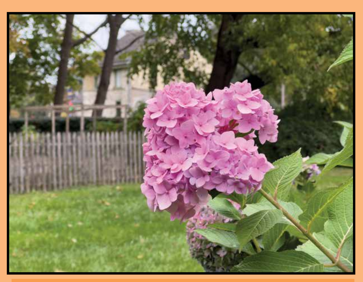
'Fall' Hydrangea blooming behind the Tenant House.