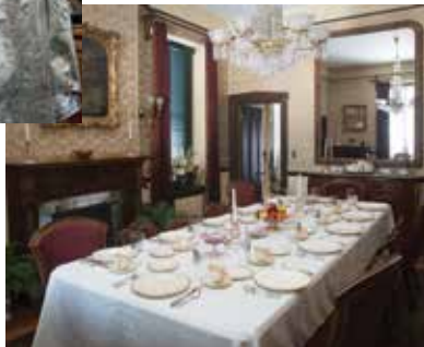
Terracina's period furnishings make it easy to imagine that you are a guest in Isabel Huston's dining room.