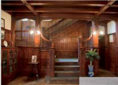
Left: The beautiful millwork and fireplaces of Graystone Mansion grace this Collegiate Gothic treasure.

and America's first female industrialist our story unfolds as dedication and innovations in iron and steelmaking drive an unbroken industrial heritage spanning over 200 years.