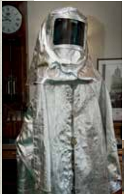
Above: Safety gear on display in the Visitor Center.